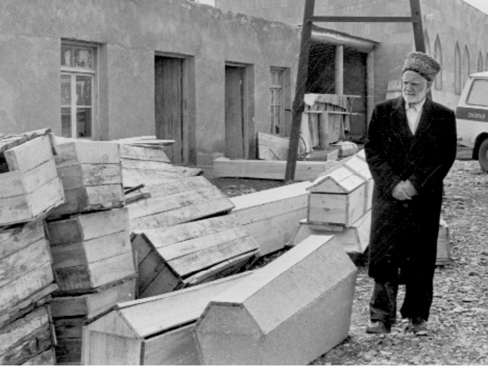
Top: Karabakh's mountainous terrain proved difficult for Azerbaijani troops, shown here in their Soviet tanks. Bottom: Caskets, piled up, used to bury the victims of Khojali. Aghdam, February 1992.