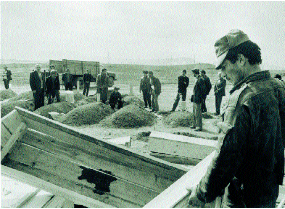
Top: Burying victims of the Khojali massacre. Bottom: A blood-stained casket; according to Azerbaijani custom, the body is taken out of the casket before being buried.